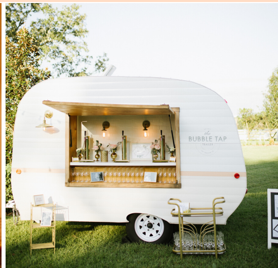
BUBBLE TAP TRAILER