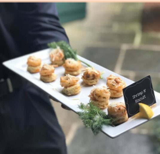
TRAY PASSED APPITIZERS